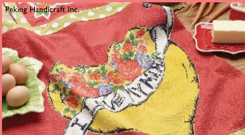
Peking Handicraft Inc.