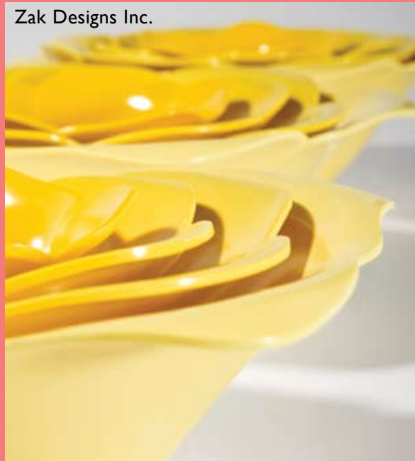
Zak Designs Inc.

THE GOURMET PRODUCTS MAGAZINE FOR RETAILERS