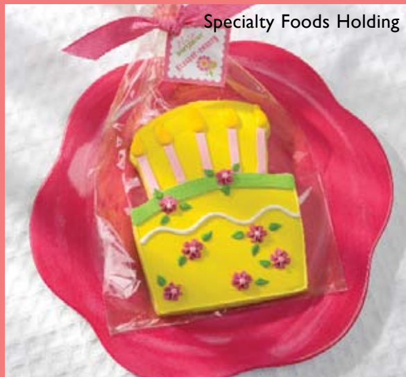
Specialty Foods Holding