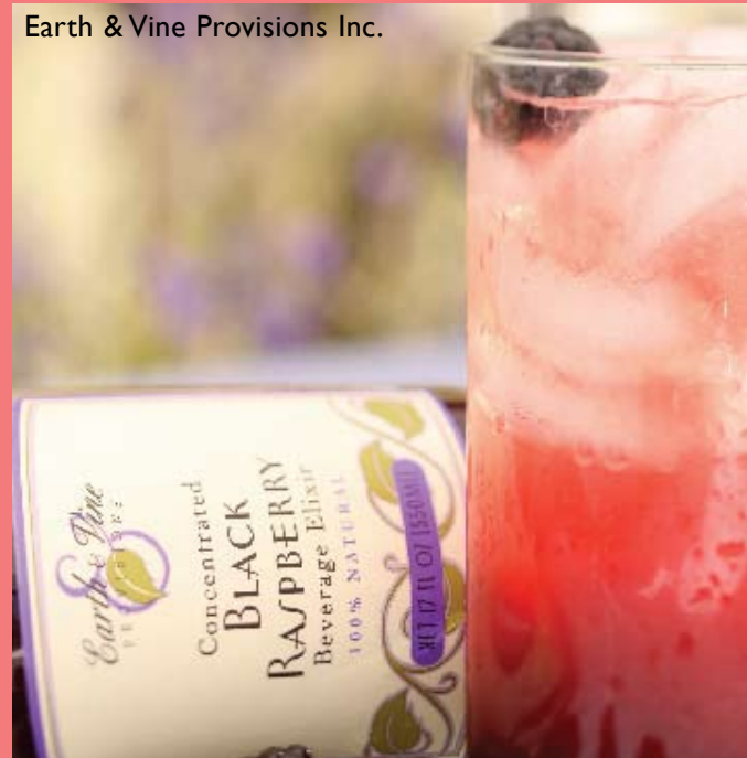
Earth & Vine Provisions Inc.