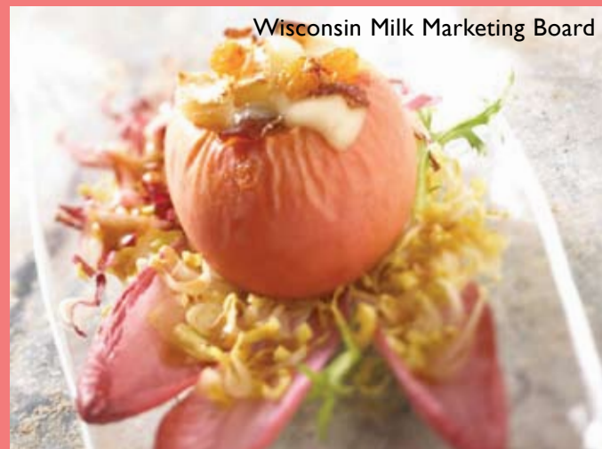
Wisconsin Milk Marketing Board