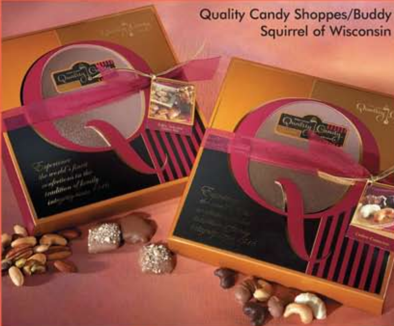
Quality Candy Shoppes/Buddy Squirrel of Wisconsin