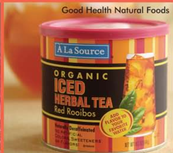
Good Health Natural Foods