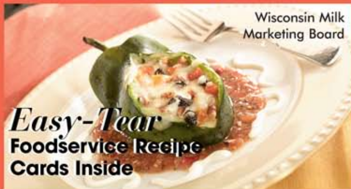
Wisconsin Milk Marketing Board

Easy-Tear Foodservice Recipe Cards Inside