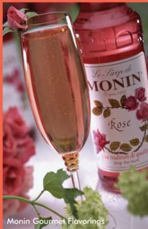
Monin Gourmet Flavorings

Easy-Tear Foodservice Recipe Cards Inside